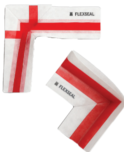
Flexseal Corner Patch